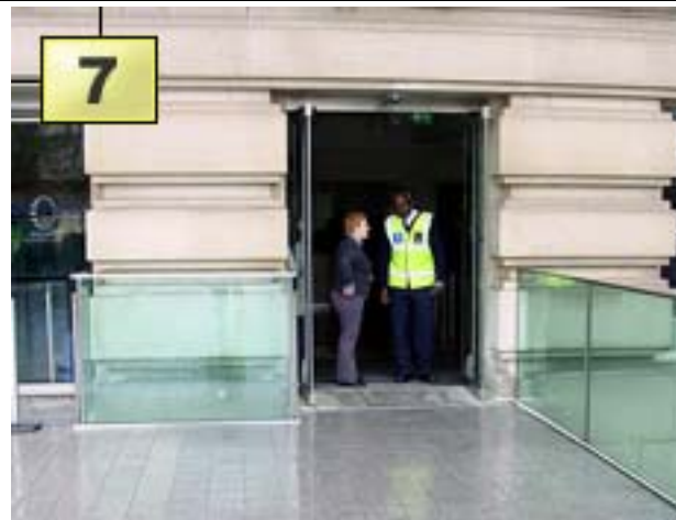
This is the entrance to the Ticket Office . (There are also steps to this entrance)